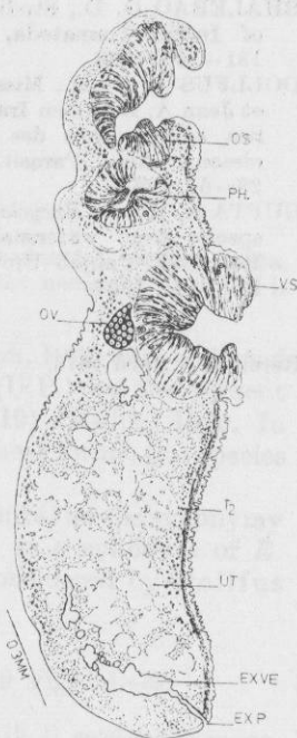
Fig. 3. Encyclometra colubrimurorum (Rudolphi, 1819), a median sagittal section, showing the terminal excretory pore and ovary dorsal to the ventral sucker.

E. japonica , as reported by Srivastava and Ghosh (1968) from the snakes, namely Ptyas mucosus , Natrix piscator , N. stolata and Atrietium schistosum from Calcutta (West Bengal) and Patna (Bihar), should now be taken as E. colubrimurorum .