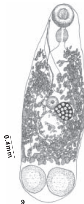
Figure 9. Opisthioparorchis yunnanse Li, 1996 Whole mount, ventral view

(Whole mount). Body elongate, somewhat narrow anteriorly, broader posteriorly, with bluntly rounded ends, spinose. Oral sucker subterminal, almost twice as large as ventral sucker,