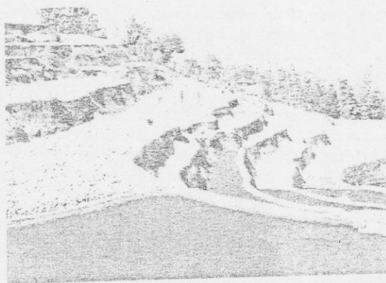
19.4: Traditional cultivation system of NEH Region. Panikheti, a system of wetland rice cultivation practiced in Nagaland and Sikkim. In this system also water is collected from top and channelized to the lower plots. Organic farming with long duration traditional rice varieties is practiced in both systems.

knowledge of land and water management. Another potential system is the farming of Alder ( Alnus nepalensis ), in and around agriculture fields, for the restoration of soil fertility and sustainable crop yield. It is even cultivated in Jhum fields. The practice is most popular among Angami, Chakhesang, Chang, Yungchinger and Konyak tribes of Nagaland. Khonoma village of Nagaland is proud of its plantation and Alder-based agriculture. Apart from this, Angami and Chakhesang tribes of Nagaland have developed a system of terrace rice cultivation ( Panikheti ). In this system, some forest area is retained at the hilltop to divert the runoff water to rice fields, through channels and sub-channels, while making terraces. Other major indigenous farming systems includes bamboo