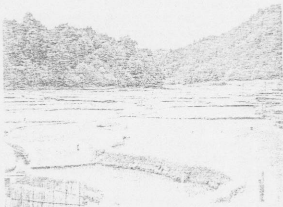
Fig. 19.3 : Traditional cultivation systems of NEH Region. Wetland rice cultivation system practiced in Subansiri district of Arunachal Pradesh. Water collected from upper plots is channelized through lower plots and a specific water level is always maintained. The system represents a unique example of water conservation.