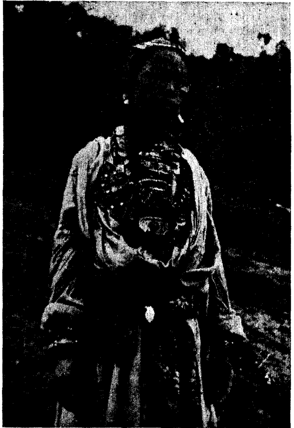
A Khowa woman of means. The various ornaments may be noted

The Khowas do not know the art of weaving and, therefore, they have to depend upon mill-made cloth like the Akas and Mijis. The costumes worn by the Khowas are usually sewn out of mill-made white markin cloth as well as the endi silk cloth of Assam. So far as dress is concerned mention