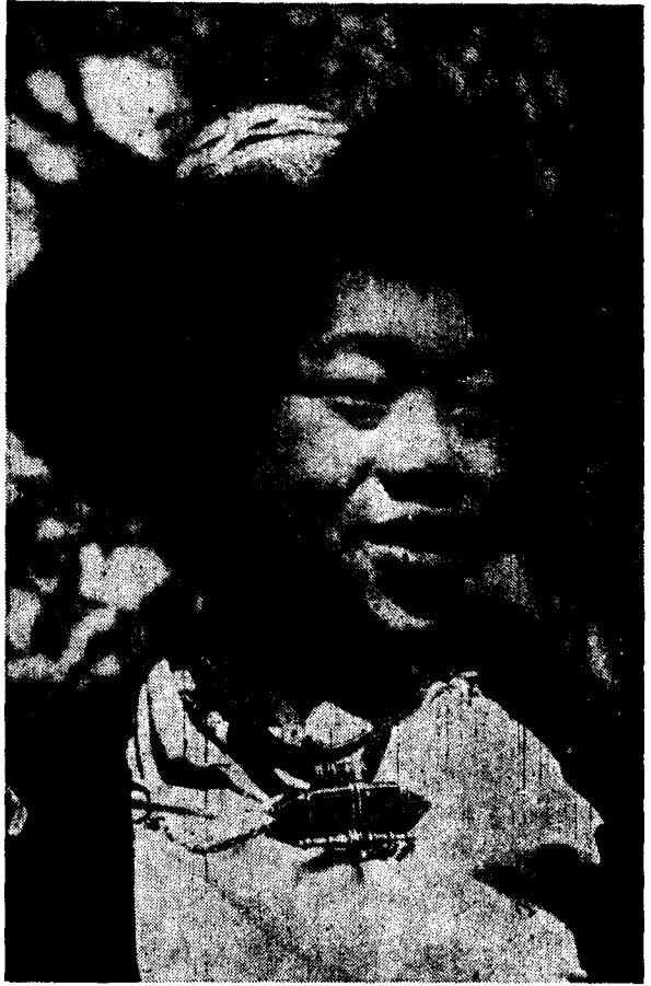
A Sherdukpen boy wearing a Monpa fur cap

cloth is worn by men. Into this a 'dao' ( handu ) is invariably stuck. Occasionally a man may wear a highly-prized sword with a haft and scabbard of silver. This type of sword comes in two sizes, the larger one being called songtho and the smaller one sapso . Men usually carry a coloured cotton bag called daung . In addition, a piece of cloth decorated with pretty patterns may be tied round the shoulders to form a fold at the back to serve as a bag for carrying things of daily use. This is woven of the fibre of locally available plants known as hongchong and hongche and is called bogre . In the past, Sherdukpens did not use footwear though on festival days they might wear Monpa shoes. Gradually, the Sherdukpens are giving up the use of their traditional dresses and adopting modern clothes and footwear.