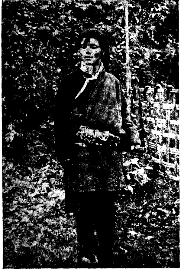
A Sherdukpen youth in full dress