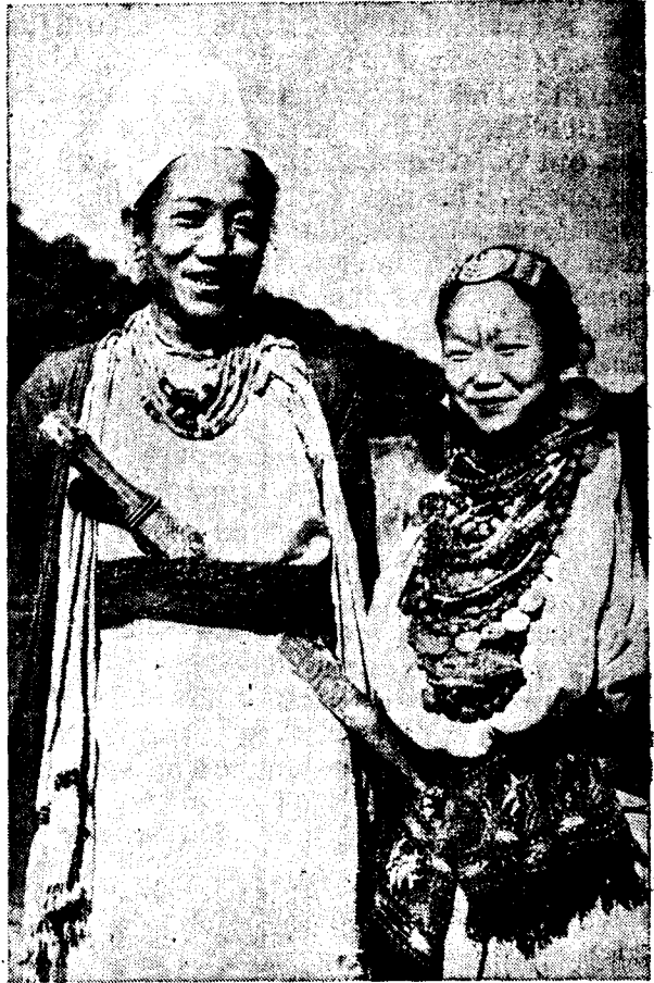
An influential Aka youth with his Miji wife

Apart from the above, women wear a small solid nickel rod shaped into an earring.