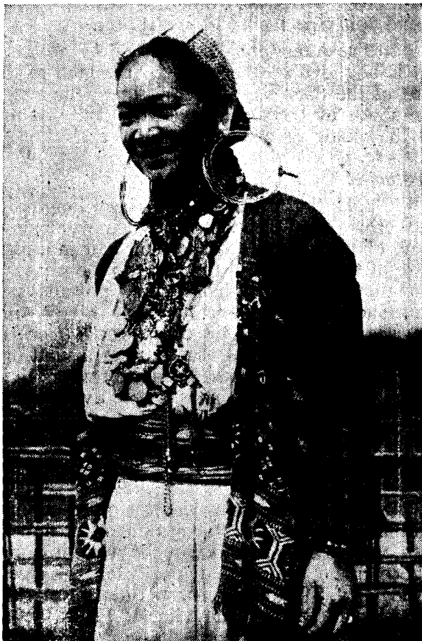
A Miji woman in her finery