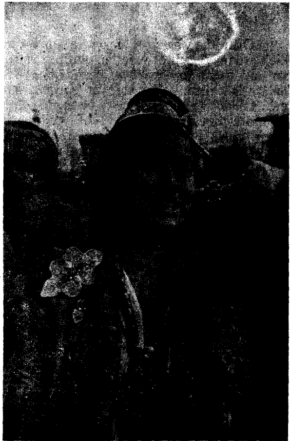
A Monpa damsel