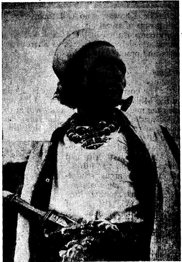
A Khowa man

may be made that in Khowa society there is no specific costume for dancing, marriage and other ceremonial occasions even for local priests ( phabi ). The normal under-garment for males is a loin cloth ( lawang ) fastened tightly at the waist with a string ( langtang ). The males cover their bodies from shoulder to knees either with a mill-made white markin cloth ( sorai-phatap ) or with endi silk cloth ( recheu-phatap ) and over it a piece of either mill-made markin cloth or endi silk cloth is worn around the waist as waist-band ( ratung ). A well-to-do man often sticks a silver sword ( loman-maduwajau ) into his waist-band. A full-sleeved jacket ( shabe ) which is sewn out of white mill made markin cloth is worn by the males over the phatap . The legs are covered from ankle to knee with gaiters ( ranak ) of white mill-made markin cloth sewn into a cylindrical shape.