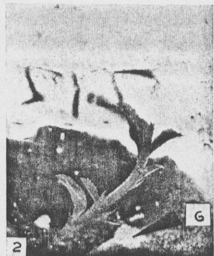
Fig. 2. Stem segment showing 'gall' (G) at the top under the effect of gall tissue extract in the medium.