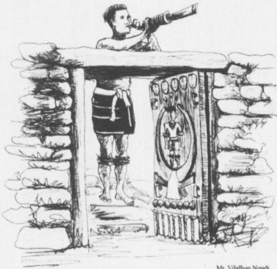
Mt. Vitilhou Noudi