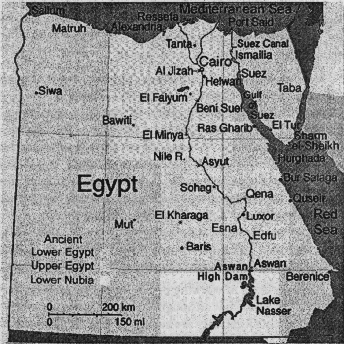
Map-2 Political Map of Egypt

Egyptian Medical Women Association etc. that have been working for women's rights. These organizations have adopted several need-based approaches to ensure active participation of young women in decision-making and policy making processes. As an author has remarked, " Women's movements in the Middle East are potential agents for democratization, yet they are highly constrained by the prevalent socio-political structures, lack of clear institutional targets and ambiguous state policies " (Al-Ali, 2002). 3 In most countries in the Middle East, a shared understanding of Gender as a social category is intimately intertwined with the overwhelming reality of Islam.