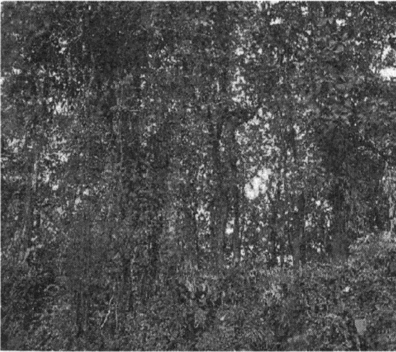
Figure 2. Vegetation structure of Tropical forest (A) and Traditional agroforest (B).