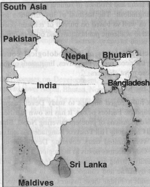
Figure 1.0 : Map of South Asia

legitimacy. This disillusionment with the socio-economic and political policies resulted into conflict and violence. Without integrative approach, the region is doomed to tangle with each other in a series of disputes that can escalate into large clashes and fated to confront each other in savage conflicts. Should this happen, the civil wars in Bosnia, Somali and Afghanistan will be reduced to shadow of the World's memory.