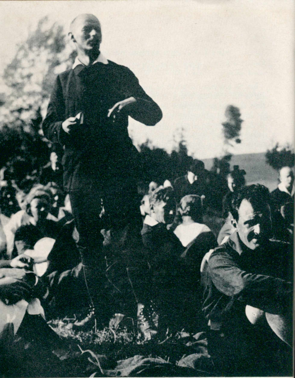
Addressing a youth rally — Early 1920's