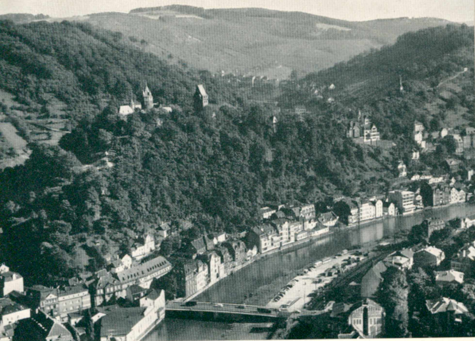
Altena and its castle