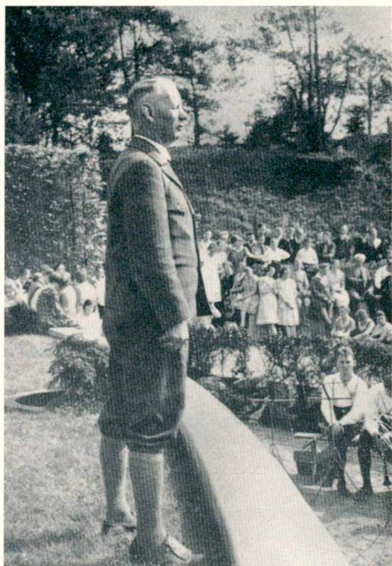
On a speaking tour, in the 1930's