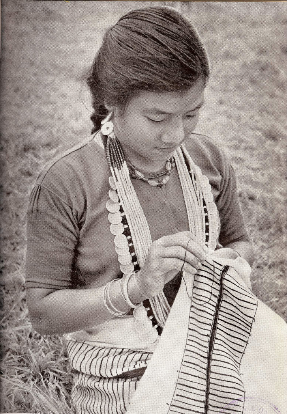
Making designs on a skirt