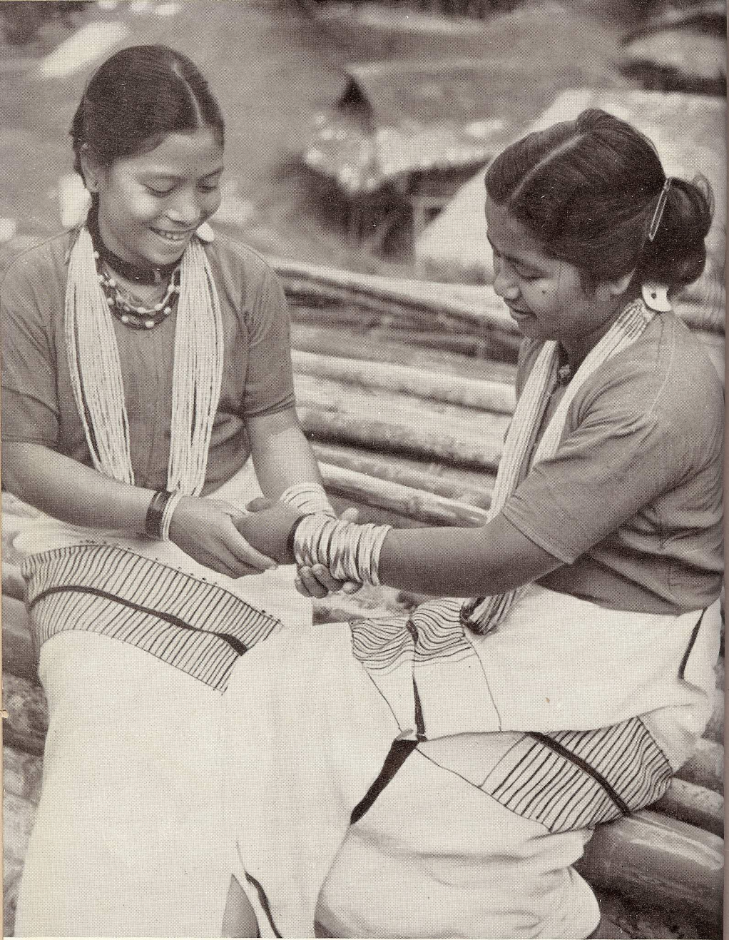
Gallong girls put on a number of bangles and chains of beads